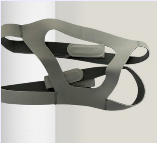
BMC MASK BELT