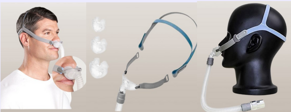
NASAL PILLOW MASK P2