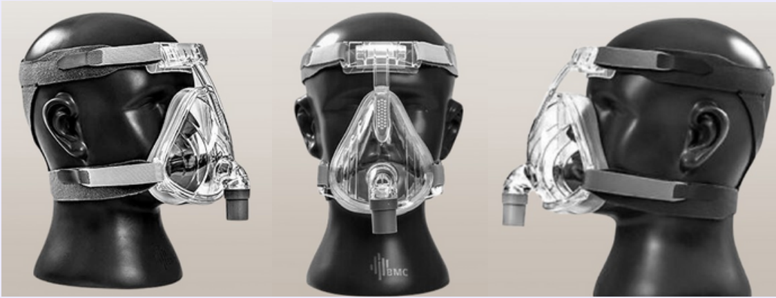
FULL FACE MASK F2